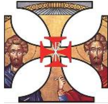
Greek Orthodox Ladies' Philoptochos Society of Holy Trinity Church