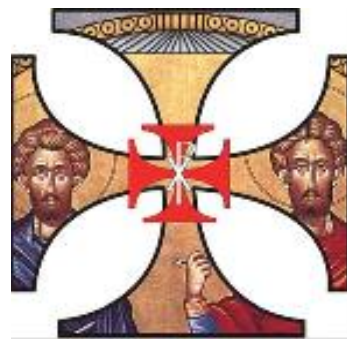
Greek Orthodox Ladies' Philoptochos Society of Holy Trinity Church